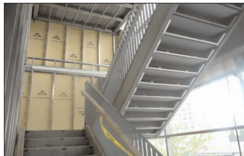
Stair T1 at 1330 Boylston Street.