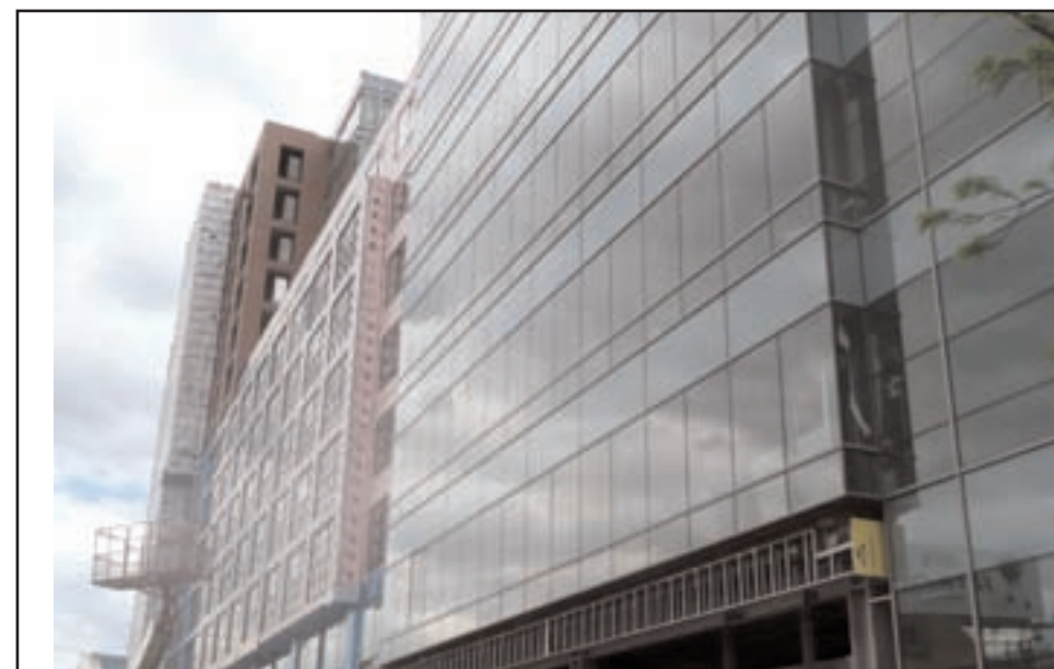
Exterior of 1330 Boylston Street.