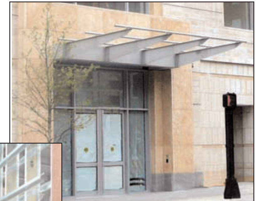
Above: Apartment entrance canopy of Mandarin Left: Stairwell at Mandarin

"Superior Rail & Iron has been building New England since 1963 and will continue to produce quality products with competitive value for the next 45 years." he said.