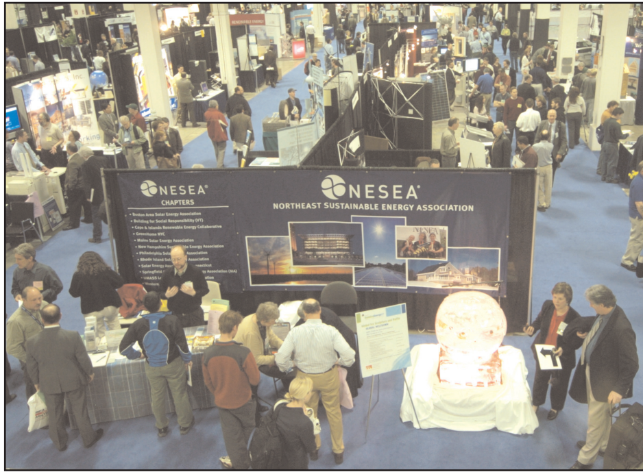
View of NESEA's Building Energy Trade Show Floor